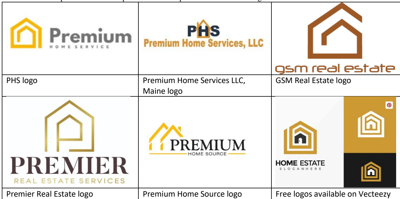
Exhibit 7 – examples of the non-unique nature of Complainant’s colours and logo